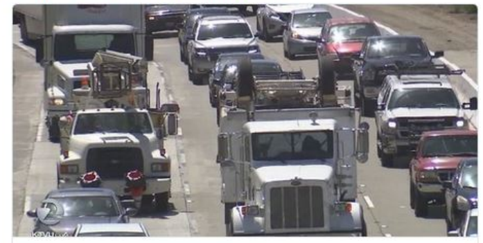
New express lanes to alleviate I-680 traffic in Alameda County Help is on the way for a notoriously slow Bay Area commute. ktvu.com